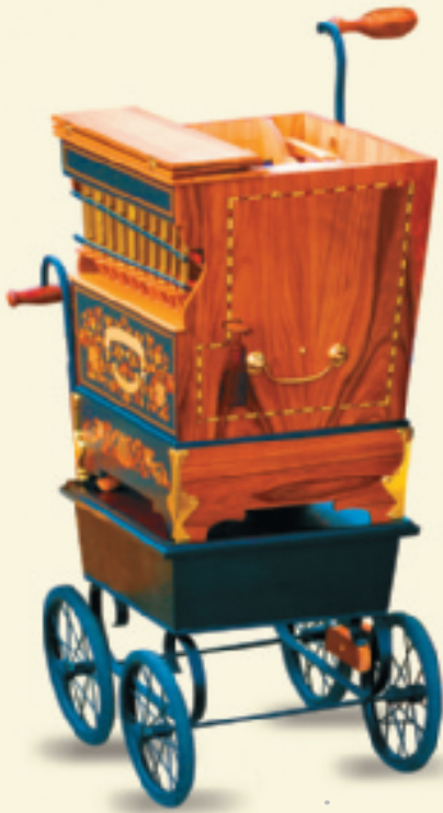
▲ Barrel organ